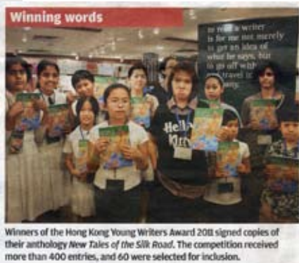
South China Morning Post's Young post, 18th May 2011